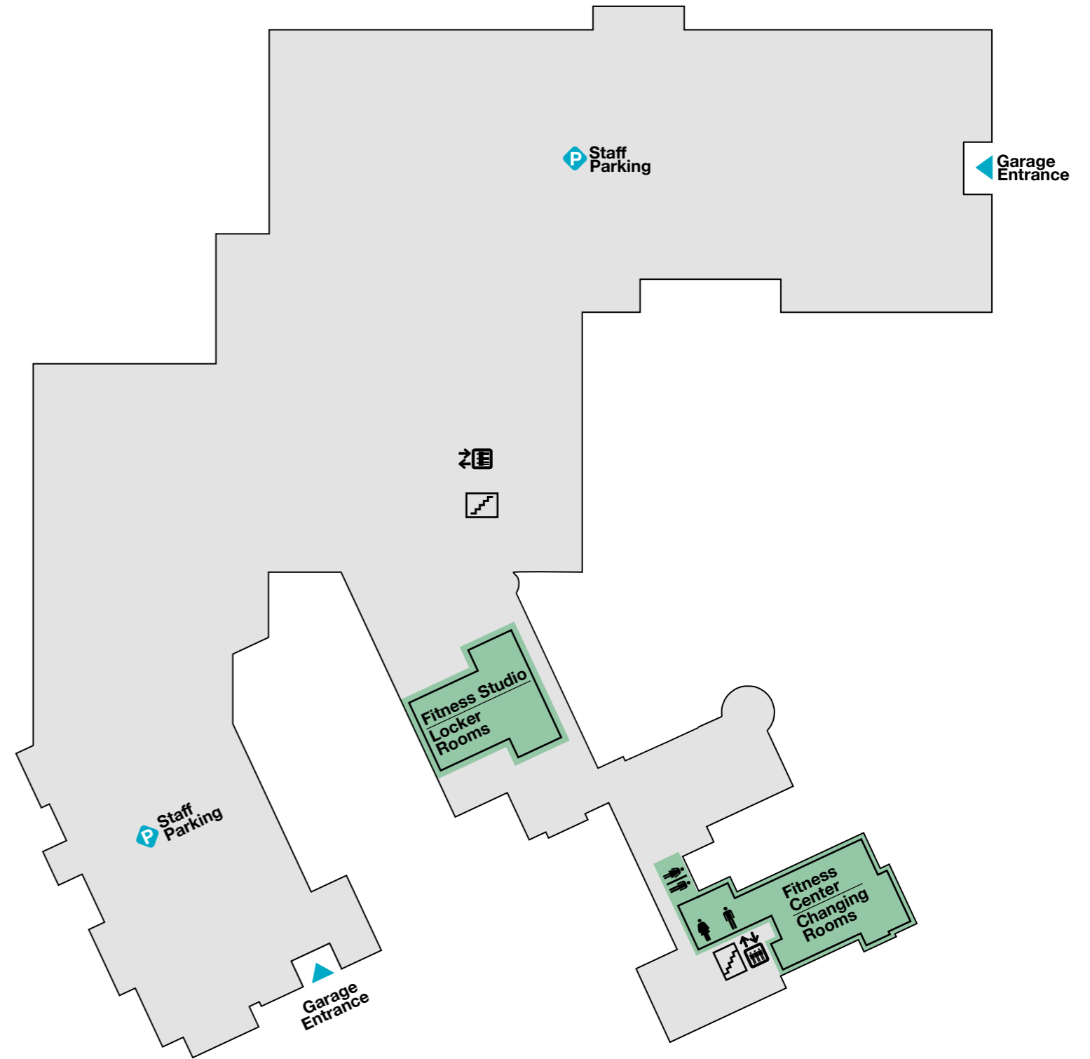
Lower Level Plan