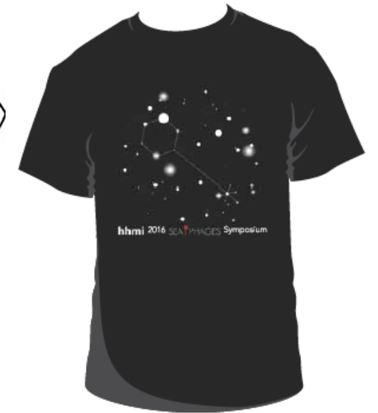
2016 T-shirt Design

Official logos for the SEA-PHAGES program and HHMI can be found at: http://seaphages.org/logo/